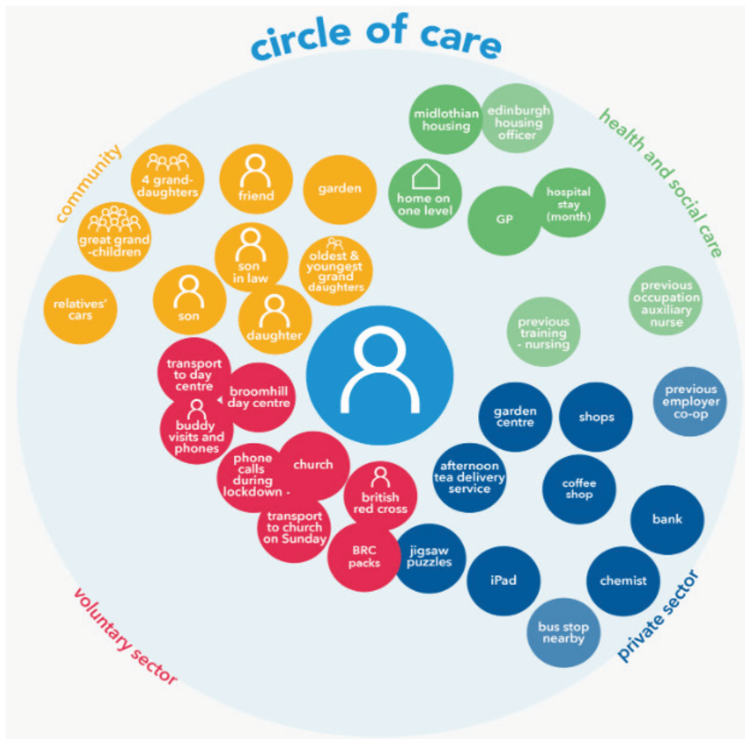
Figure 2. Circle of Care example for an interview participant who chose the pseudonym Georgina

As well as people with lived experience, the Pathfinder has also engaged closely with other users, including professionals from the third and independent sector as well as other healthcare practitioners. The final stage of engagement during the Discover/Define stage involved engaging professionals to reflect on the interviews that had been conducted with people with lived experience. In interviews with citizens, people had highlighted supports such as social activities, family, and friends, as well as the support provided by the third sector, GPs, nurses, and carers in navigating the complex health and care system. Barriers to navigating support included form filling, bureaucracy, waiting times, lack of awareness and confidence. Professionals were able to reflect on this information to support the Pathfinder's overall understanding. It also encouraged professionals to reflect on how they work and to identify opportunities for new ways of working.